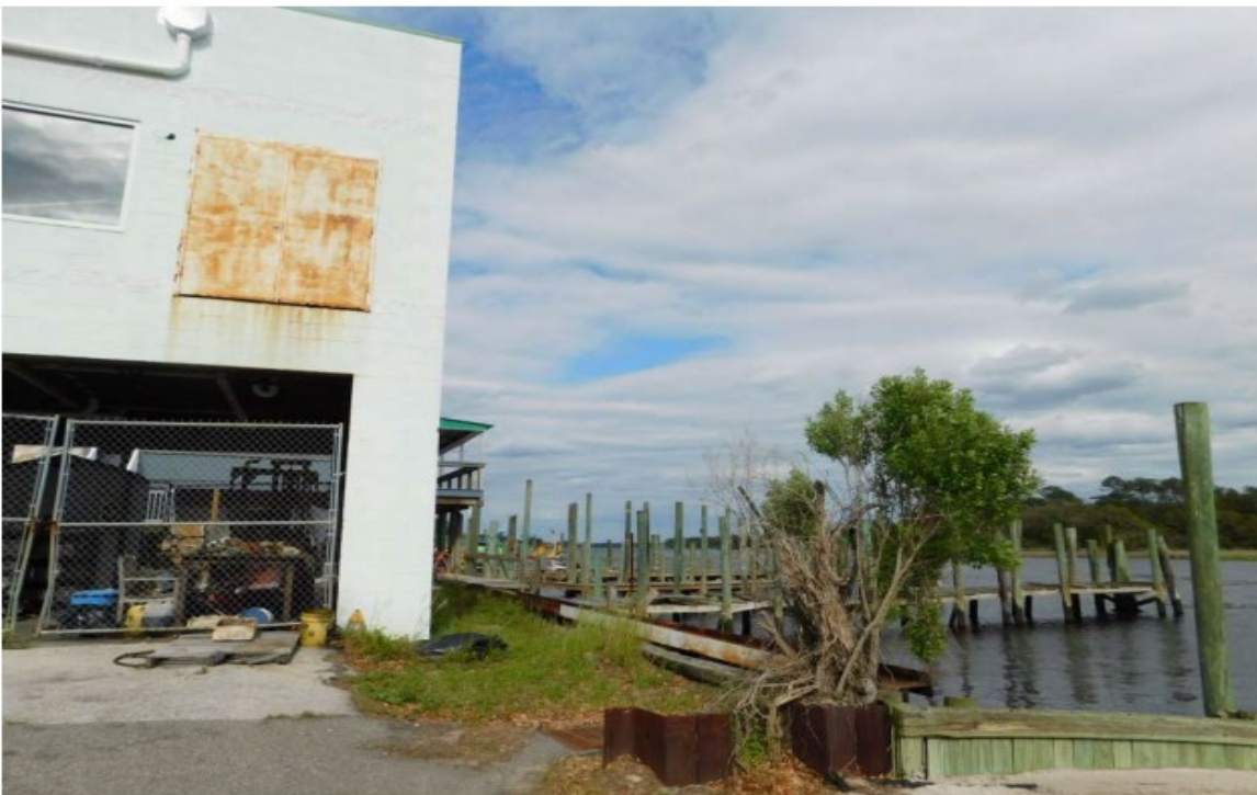
View of other side of Building and Rear Area